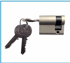
VARIOUS 1/2 EURO-PROFILE CYLINDERS