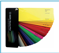
AVAILABLE IN ALMOST ALL RAL COLOURS