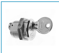
VARIOUS SCREW CYLINDERS